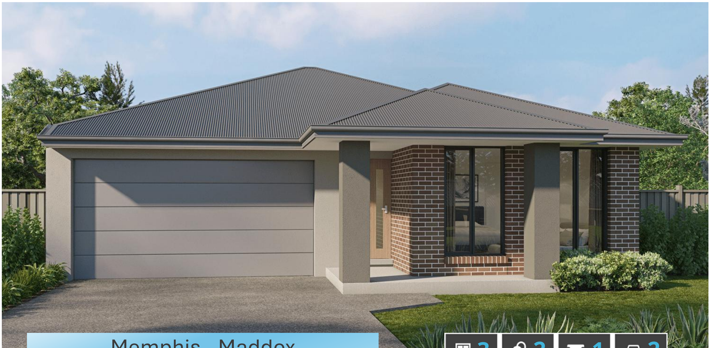
Memphis - Maddox