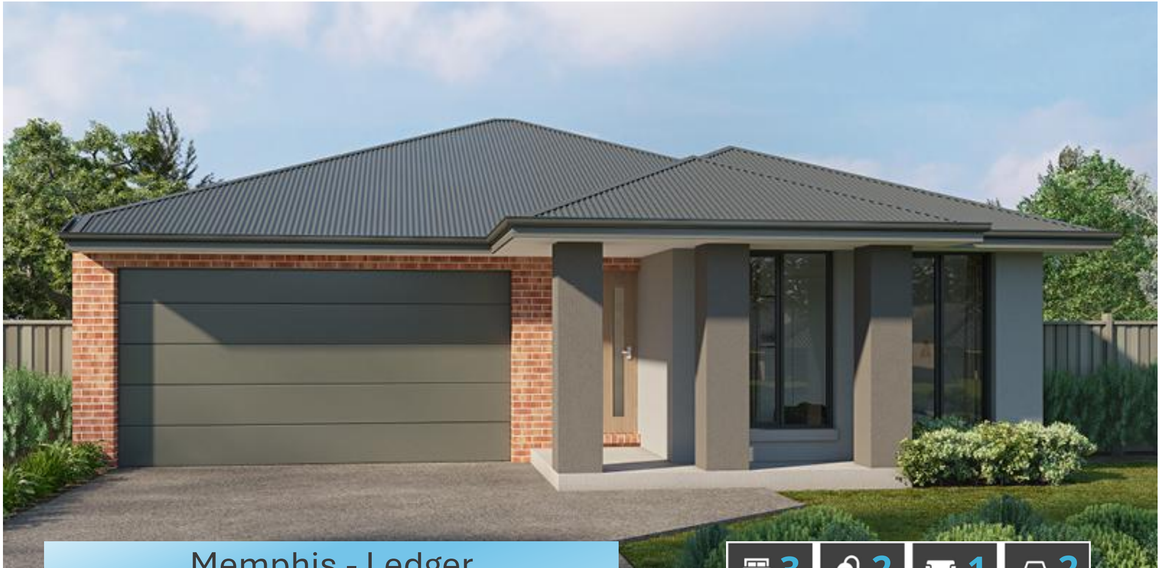
Memphis - Ledger